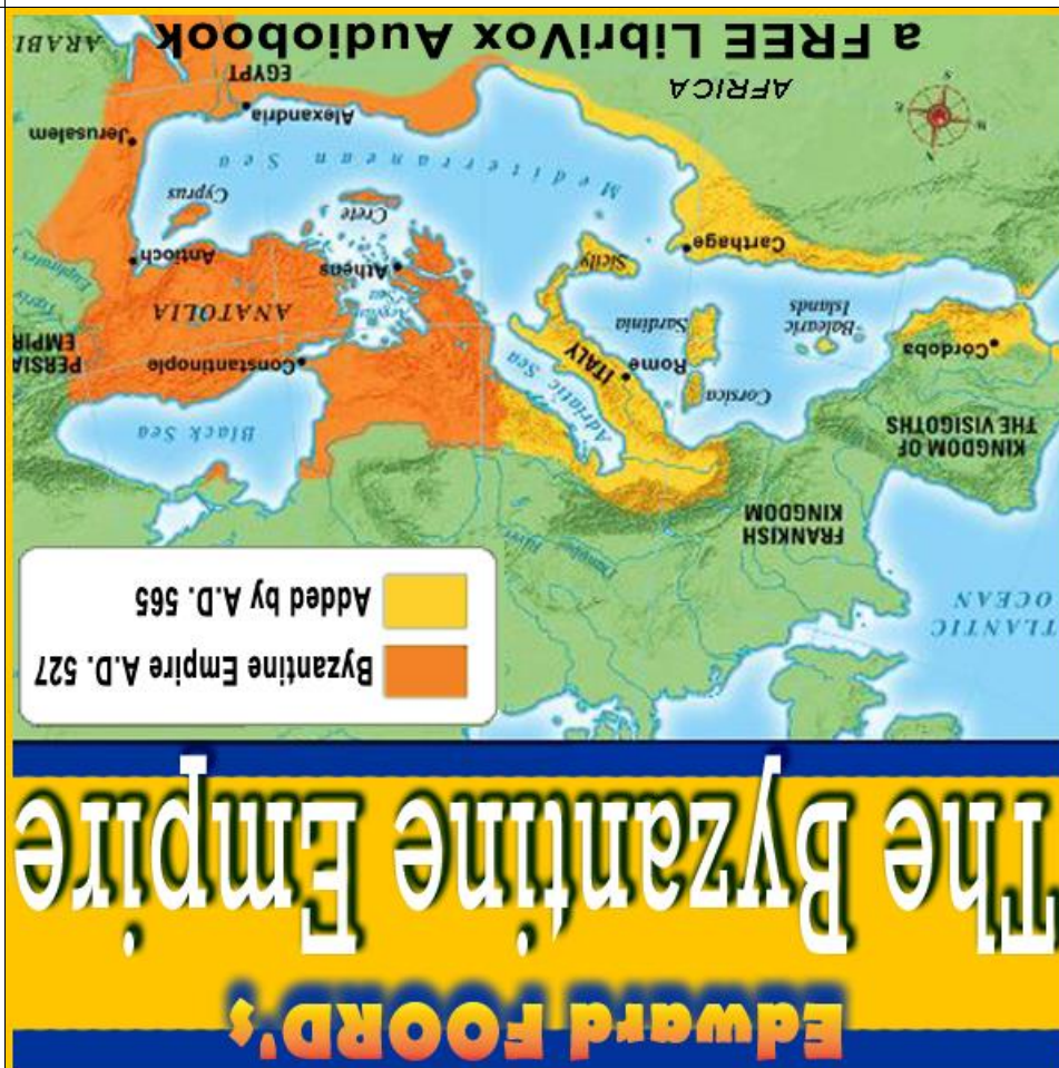
Cover image: Byzantine Empire map, Justinian Expansion Cover design for Librivox by Michele Fry

Print Page 3 on regular or 20 lb bond paper for ease of folding.